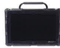
Prentke Romich Company Accent 1000