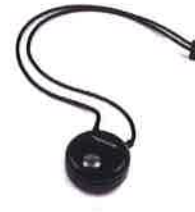
ClearSounds Quattro Pro