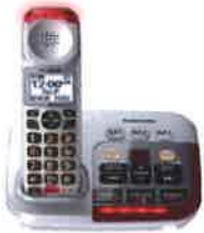
Panasonic KX-TGM 450