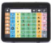
Tobii- Dynavox I-110