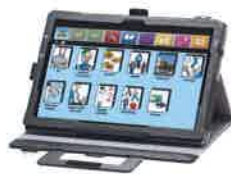
Lingraphica Touch Talk