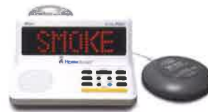
Home Aware Kit